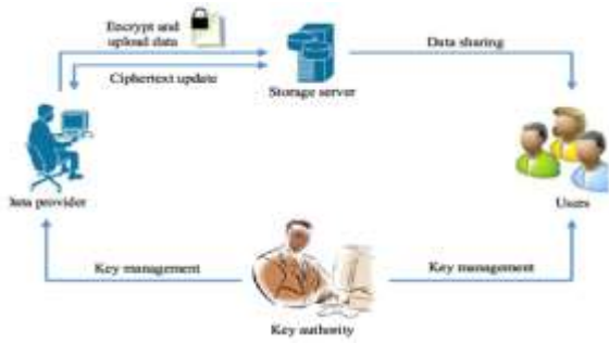
Fig.2: System architecture