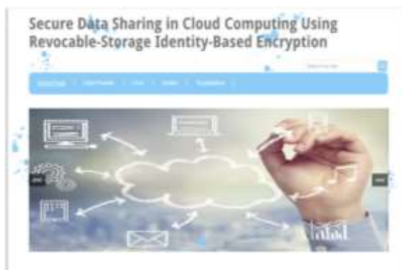
Fig.3: Home screen