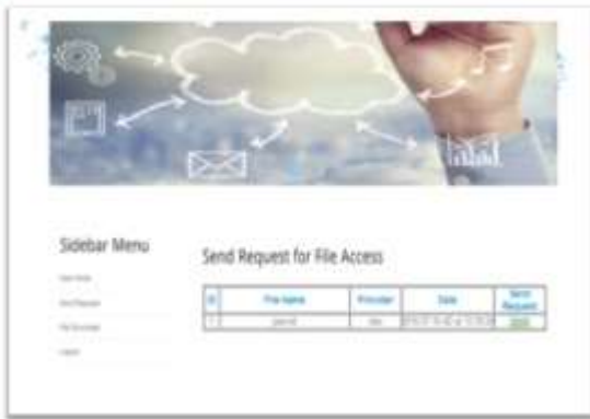
Fig.8: User request send for access