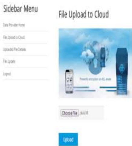
Fig.6: upload data