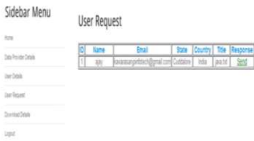
Fig.7: User request